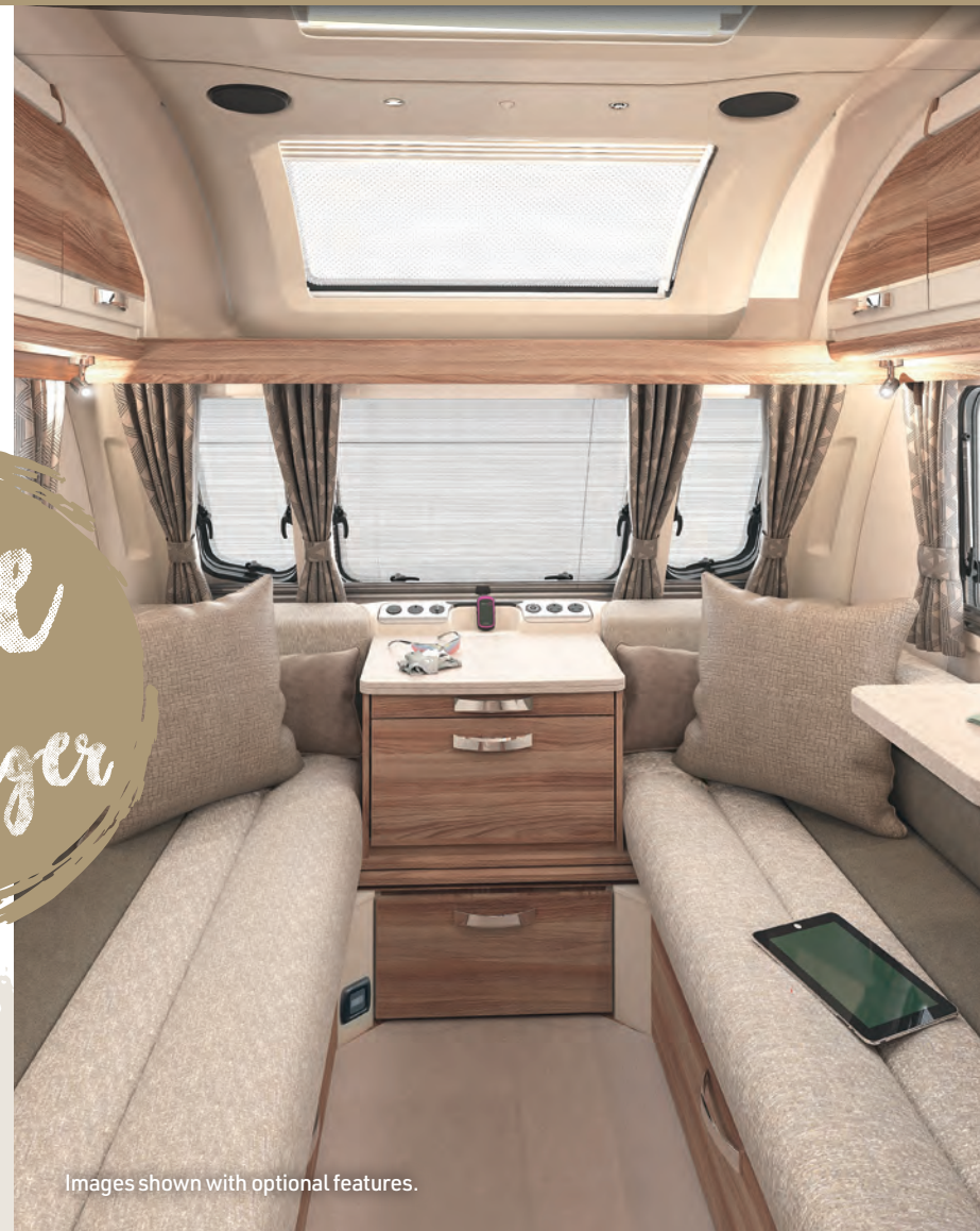
Images shown with optional features.

For extra space, choose the 8ft-wide Challenger X, it's the Challenger you love, just roomier.