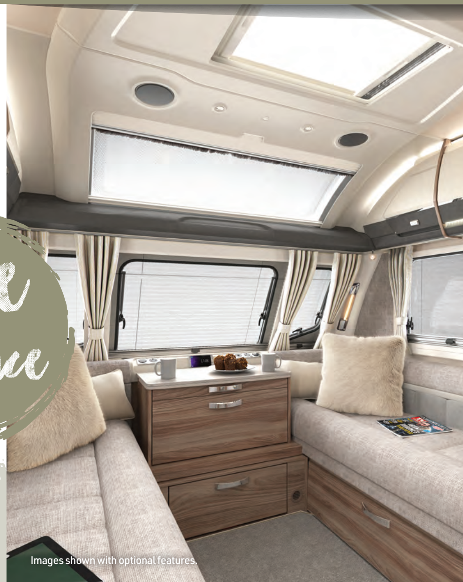
Images shown with optional features.

Elegance Grande embodies the ultimate travelling luxury, hosting all the exquisite features with even more living space.